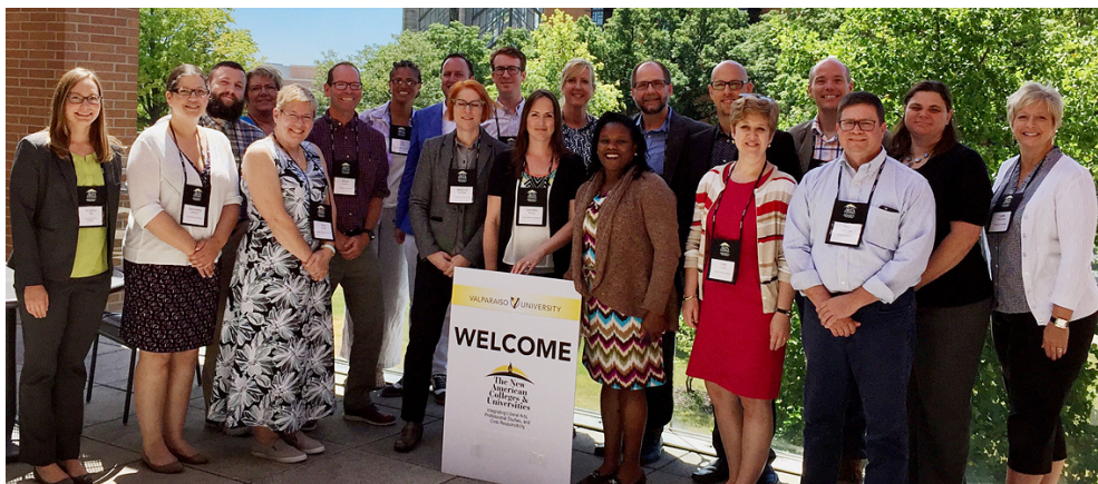
NAC&U Ambassadors at the Summer Institute 2017

The NAC&U Faculty Ambassadors have accomplished much in three years, including the recent creation of a planning grant for cross-institutional collaborations known as the Collaboration, Growth, and Innovation (CGI) Grant Program . This new program comes on the heels of the successful NAC&U Award for Student Excellence that was implemented last year by the Faculty Ambassadors. Read more.